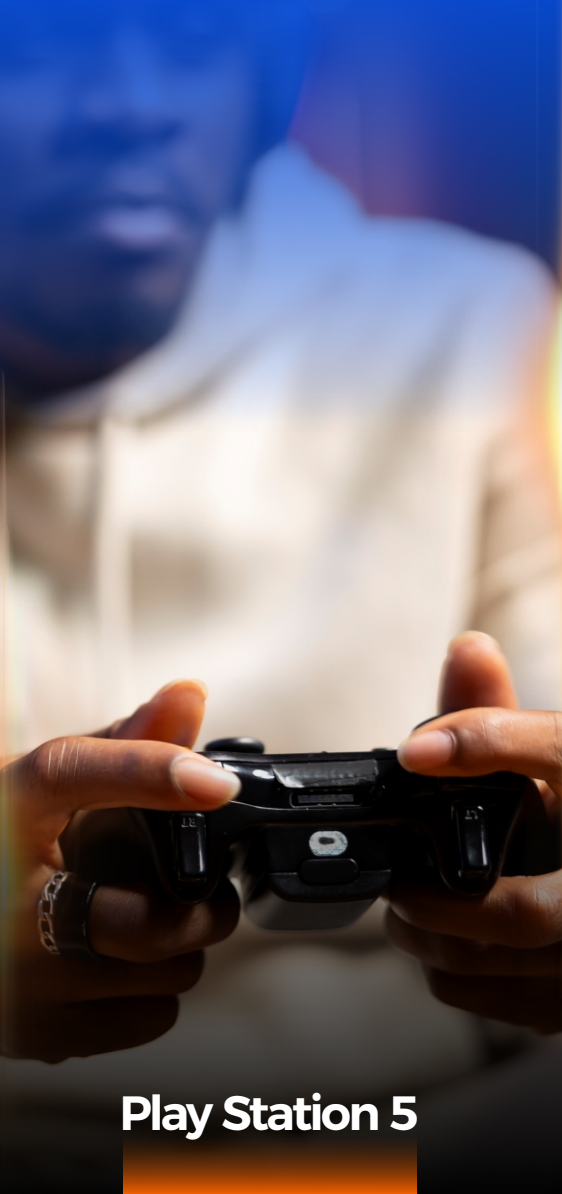
Play Station 5